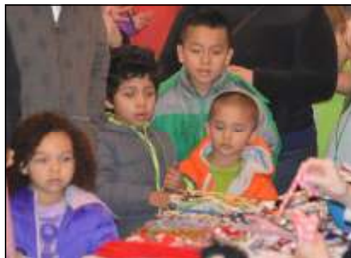
Children's eyes sparkle as they receive a candy cane and an orange to insert in the stocking they get to choose at the Presents from Partners party.