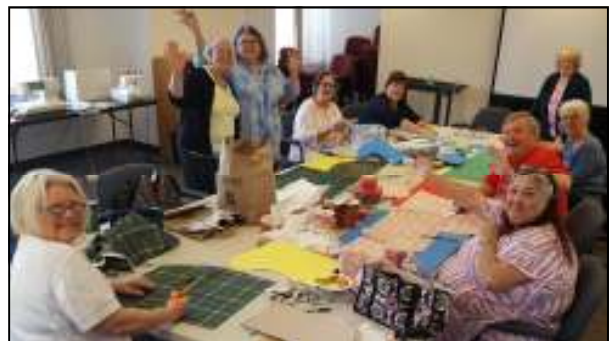
Part of the stocking-cutting Army!